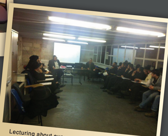
Lecturing about our way of helping Youth at risk